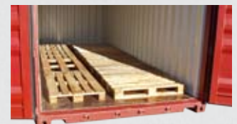
10 x EU 9 x UK

Standard features include flat flooring for ease of use, 130cm wide butchers door with internal release, internal lighting and alarm with 2 sirens, heater cables to prevent the formation of ice around the door frame, pressure equalizing valve and a thermometer beside the butchers' door.